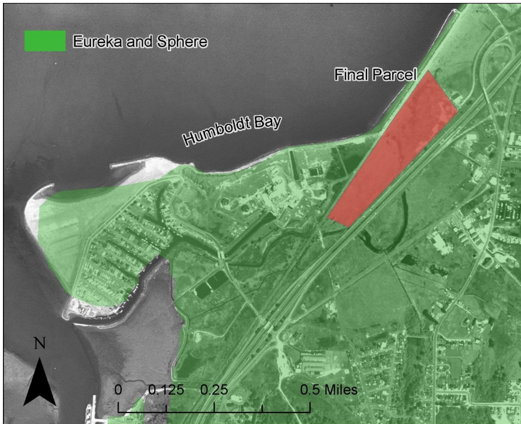
Figure 3- Final Parcel location